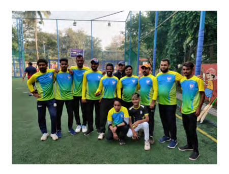
hearted participation of all the participants and the