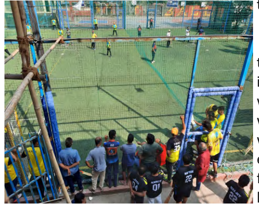
High School, Wadala West.

We, the organizers, are overwhelmed by the response and the whole-