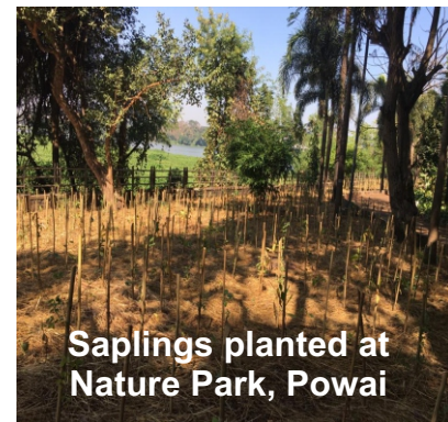
Saplings planted at Nature Park, Powai