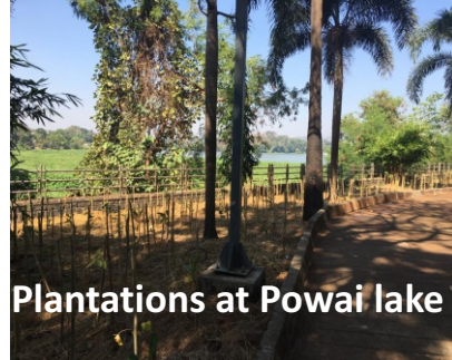
Plantations at Powai lake

We will be responsible for executing the Miyawaki method of tree plantation over the entire eastern suburbs by planting 2,25,000 native and indigenous species of trees." His firm, Madhani Corporation,