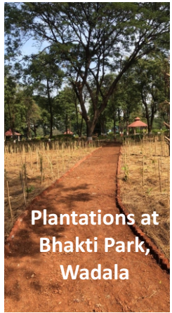
Plantations at Bhakti Park, Wadala