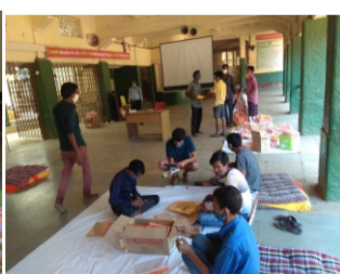
AGNI in COVID-19 H/West